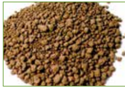
Same soil treated with Garden Mate