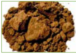
Soil treated with Gypsum

Garden Mate will improve soil structure, breaking up clay soil and binding together sandy soil.