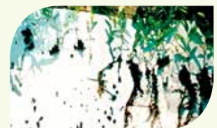
Without Garden Mate | With Garden Mate

PROBLEM SOILS OR AREAS 500gm/m 2 (5 handfuls approx) HEAVY CLAY SOIL OR VERY SANDY SOILS 1kg-2kg/m 2 (10 -20 handfuls approx) MOST PLANTING SITUATIONS 300gm/m 2 (3 handfuls approx) GENERAL CONDITIONING 100gm/m 2 (1 handful approx) RE-POTTING 25gm/L potting mix (1 tablespoon)