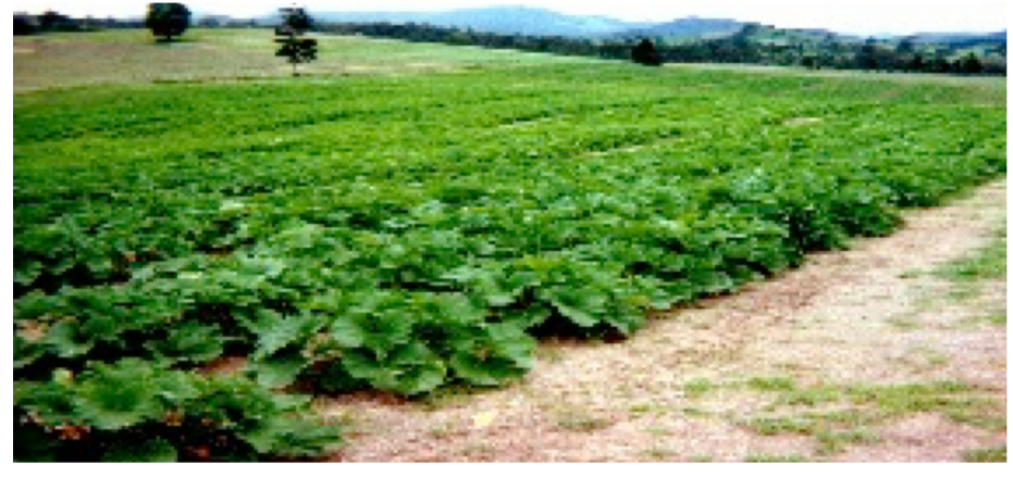
8 Weeks Later (November) Just starting to pick

Neither cold nor hot weather significantly reduces Break Down Plus's ability to accelerate stubble breakdown