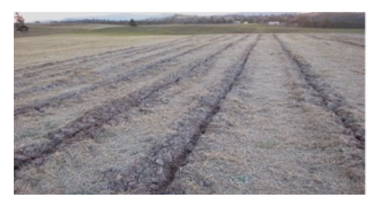
8 Weeks Later (September)

The accelerated breakdown of organic matter to plant available nutrients has several benefits.