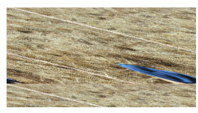
Before Break Down Plus was applied (late July)